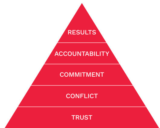
The Five Behaviors Model

The experience is completed through a half-day training session, led by a trained Five Behaviors expert. This session includes a walkthrough of the Personal Development profile, breakout activities, and group discussion.